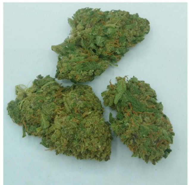
CAMPIONE ANALIZZATO: Finola(10.00gr)